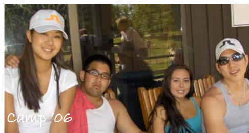
Some photos from Sunnyside Camp '06