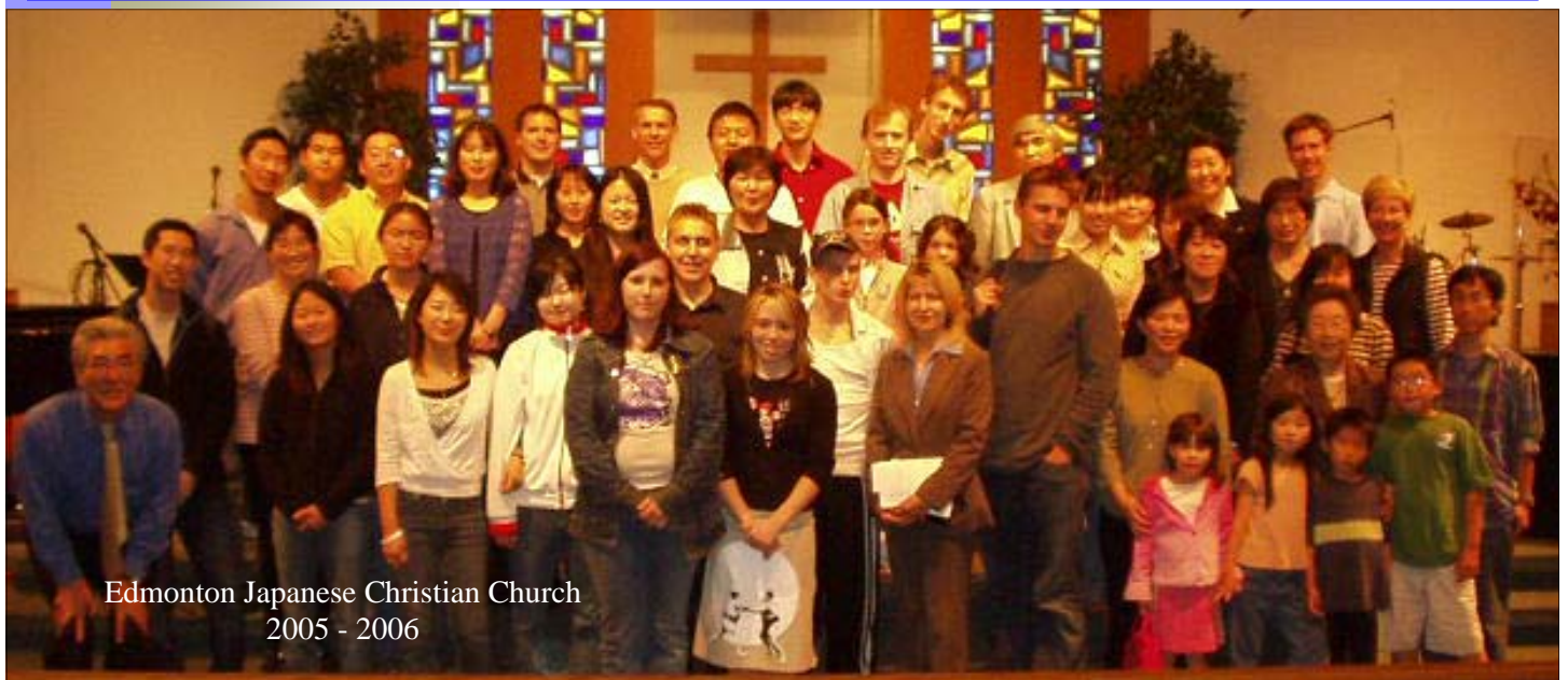
Edmonton Japanese Christian Church 2005 - 2006